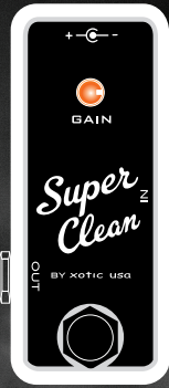
amp overdrive naturally overdrive amp tones