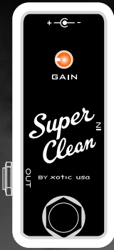
clean solo boost slight boost with pronounced mids