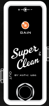
pickup interface equal output for various guitars