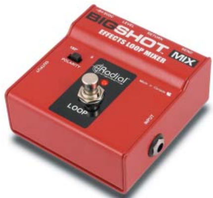
Radial BigShot MIX - order # R800 7203

The BigShot MIX is an active effects-loop device that allows you to mix the direct sound of an instrument with effects in the same way a professional mixing console lets you add reverb to a dry vocal track. The BigShot MIX is designed for the guitar or bass player who wants to blend-in the sound of effects pedals with their fundamental instrument tone. The recessed level control allows you to set the wet/dry mix between the direct instrument sound and the effects-loop.